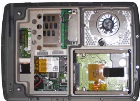
Inside of the GD-Itronix Duo-Touch II: note standard hard disk spindle heating patch

The Duo-Touch II also meets ASTM 4169-99 truck assurance Level II, Schedule B. ASTM stands for American Society for Testing and Materials but is now simply known as ASTM Inter-