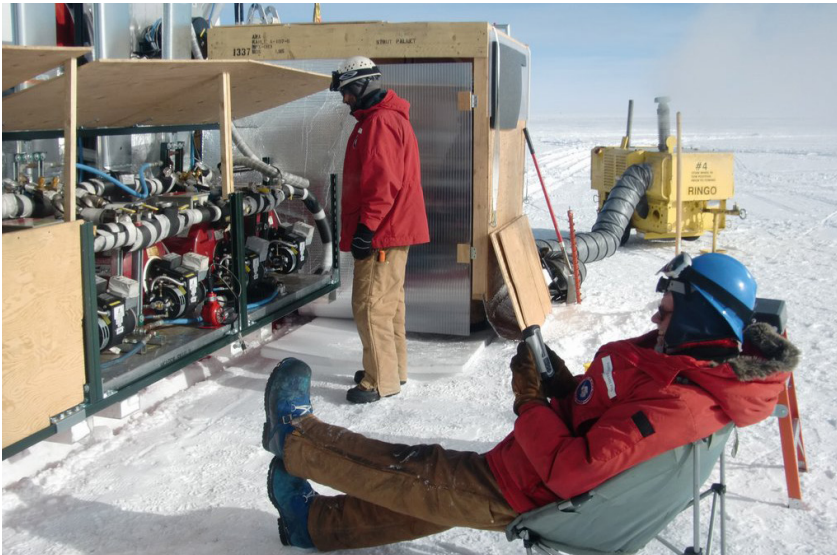
▲ ICE CUBE PROJECT at the South Pole records the interactions of a nearly massless sub-atomic particle called the neutrino.

and tutorials in the field, ruggedized computers with large memory and Internet connectivity become more and more valuable.