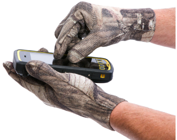
▲ CAPACITIVE OR TOUCHSCREEN GLOVES made with conductive material enable the wearer's natural electric capacitance to operate capacitive touchscreens without removing protective work gloves.

Broadband and voice carriers likewise hasten to bundle their services in handheld form factors with 3G or better data capability, setting up whole divisions to package, upgrade, manage, and monitor enterprise mobile deployments. Third-party device management has also